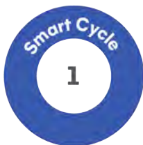
IVF Live Donor Fresh Donor services and creation of embryos including transfer to member