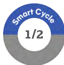
Frozen Oocyte Transfer (FOT)