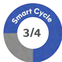
IVF Fresh Cycle

Visit the Explanation of Covered Treatments & Services section of the Member Guide to learn more about what's included in each Smart Cycle and additional covered services. Unless specified, the stated Smart Cycle value for treatment is applied in full, even if you choose to forego any included services. For a full explanation of what's covered under each Smart Cycle, visit the Definitions for Covered Services section.