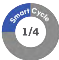
Frozen Embryo Transfer (FET)