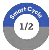
Pre-Transfer Embryology Services