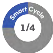
Purchase of Donor Sperm 4 vials