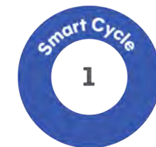
IVF Live Donor Freeze-All Donor services and creation of embryos not including frozen embryo transfer