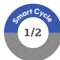
Pre-Transfer Embryology Services