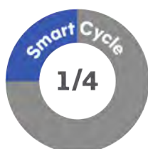
Frozen Embryo Transfer (FET)