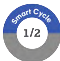
Frozen Oocyte Transfer (FOT)