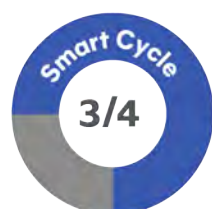
IVF Fresh Cycle

Visit the Explanation of Covered Treatments & Services section of the Member Guide to learn more about what's included in each Smart Cycle and additional covered services. Unless specified, the stated Smart Cycle value for treatment is applied in full, even if you choose to forego any included services. For a full explanation of what's covered under each Smart Cycle, visit the Definitions for Covered Services section.